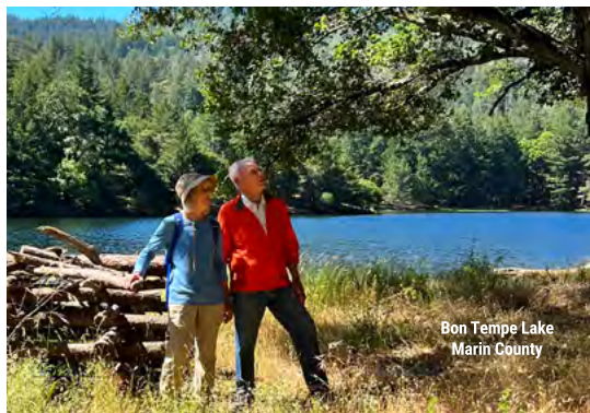
Bon Tempe Lake Marin County

Villa Marin is an exceptional senior living community located on a hill in beautiful Marin County. At Villa Marin, you own your condominium: studio, one, two or three bedrooms, with private or enclosed balconies and stunning views.