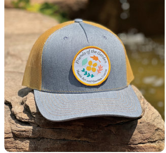
Tommy Breeze Hat